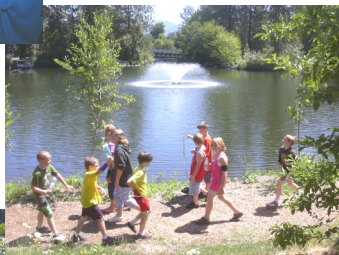
Walking to soccer in the beautiful park