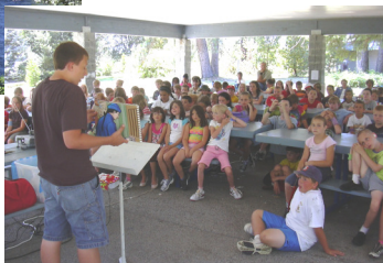
Listening to exciting stories