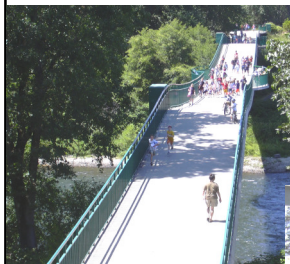
On the big bridge to the YMCA