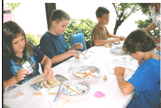
Making cool things In crafts

SWIMMING! SOCCER! BASKETBALL! CRAFTS! BIBLE STORIES! FRIENDS & STAFF FROM GOOD NEWS CLUBS!